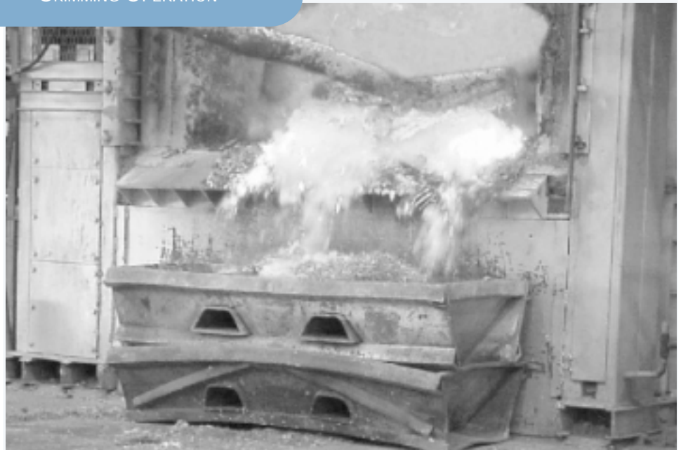
Skimming operation for the removal of dross from an aluminum melting furnace.